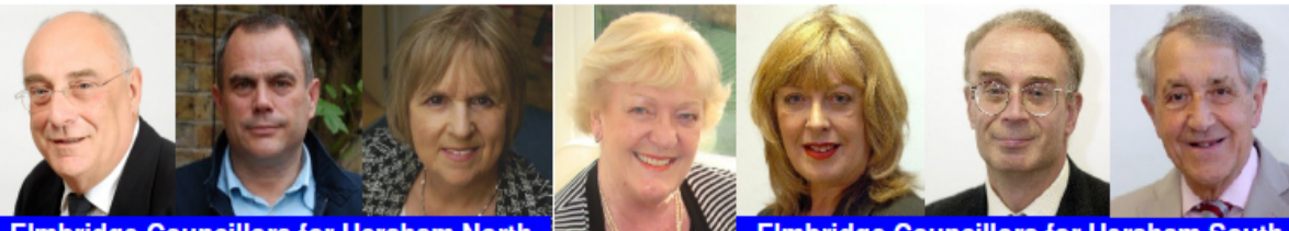
Elmbridge Councillors for Hershams North

If you have any issues you would like to discuss, just drop in at our next session on Sat 31 March. No appointment is necessary and they will be available from 10.30 till noon. A private room is available for anything you wish to discuss in confidence.