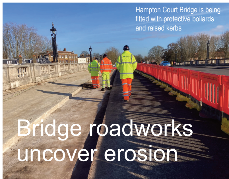
Hampton Court Bridge is being fitted with protective bollards and raised kerbs

UKRAINE: Could you sponsor refugees from the war in Ukraine by providing a room in your home? If so please sign up at the Government's website: https://homesforukraine.campaign.gov.uk . If you wish to donate to help the Ukrainian people in their time of crisis you can do so through the British Red Cross at donate.redcross.org.uk/