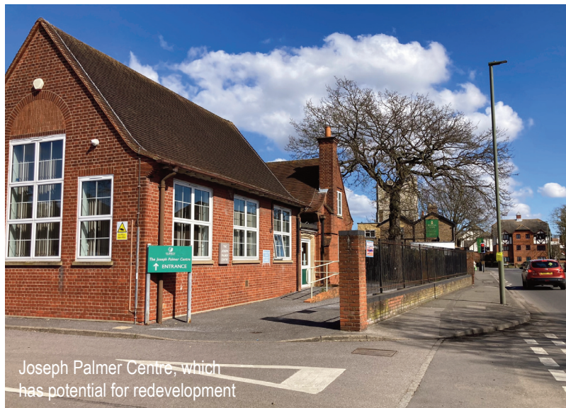
Joseph Palmer Centre, which has potential for redevelopment

However, the list of potential sites is also likely to raise eyebrows, including the East Molesey car park (23 units), land at Hampton Court Station including the Jolly Boatman (97 units), Sundial House off